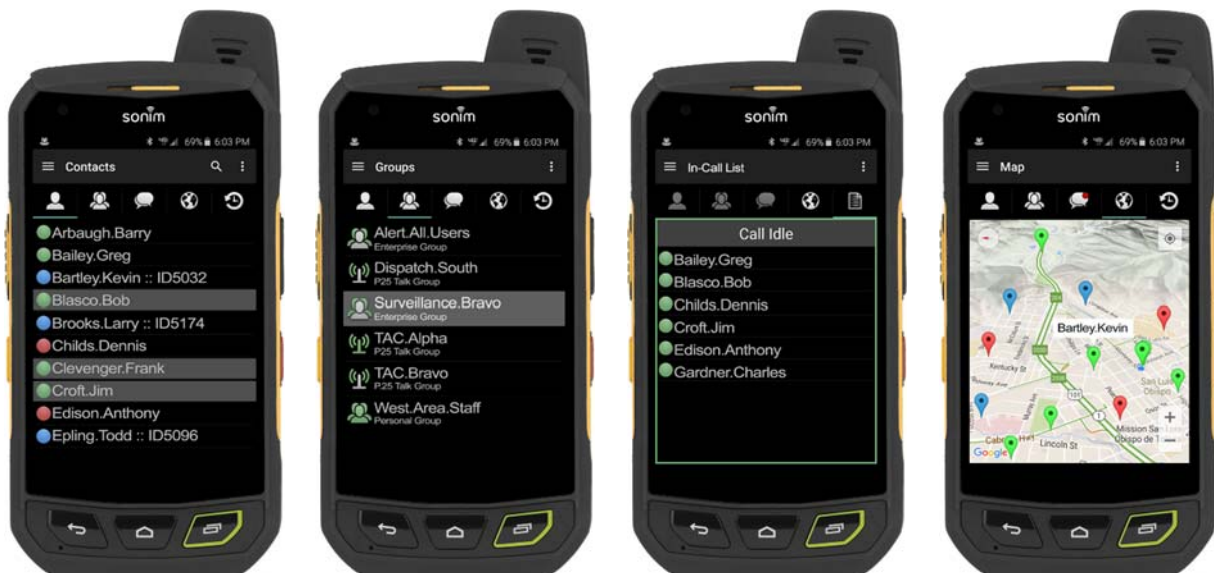
Sonim XP7 Ultra Rugged Handsets with ESChat

In gathering the information for this case study we interviewed a number of people involved with the project at LA-RICS and at the LA County Sheriff's department. One person who was interviewed stated that very soon after he began to use ESChat on the Sonim device he realized he no longer needed his LMR radio in order to stay current and in the loop. Another tells of someone who at one point during the parade wanted to contact an ESChat user from inside a fire station that was outside the LA-RICS LTE coverage. Fortunately, the ESChat user called him using ESChat and he was able to respond because he had access to Wi-Fi and the Internet inside the fire station and he was able to continue to use the system.